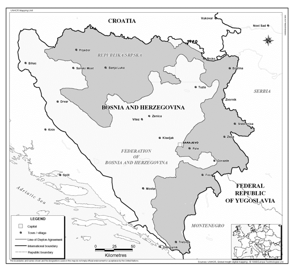
Figure 2: The 1995 Dayton Agreement for Bosnia and Herzegovina